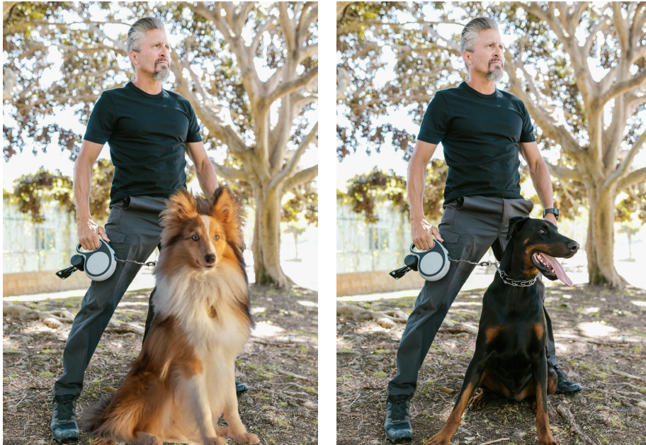
Figure 1: A ‘real’ human standing with a ‘not-so-real’ dog.

Consider Figure 1: you see a human standing with two breeds of dogs. Which breed of dog do you think is the actual dog of the human in question? If you guessed the image on the right, then you are correct. The resemblance between the dog and the owner is uncanny. There is a lot of research that has been done in regard to whether people choose dogs who look like them or give their dogs major makeovers to make them look like them in time. We will leave this question to be answered by people who know dogs and psychology, but we know computer vision and we want to train computers to identify which dog belongs to which human. Why, you ask? Cause why not?